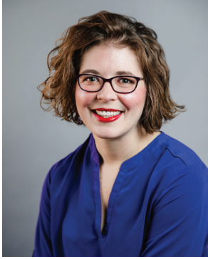
Alicia Levy Chair