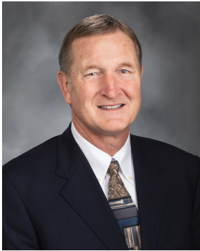
Senator Jeff Holy