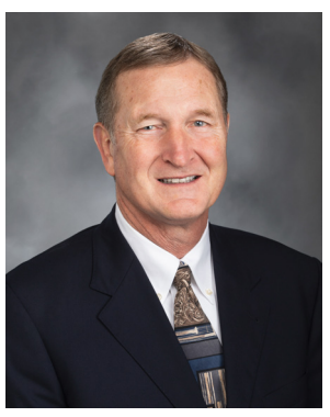
Senator Jeff Holy