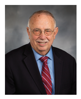
Senator Steve Conway