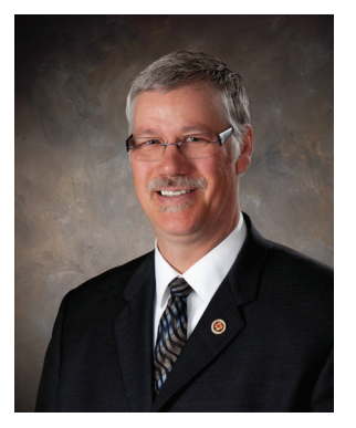
Bud Sizemore Chair