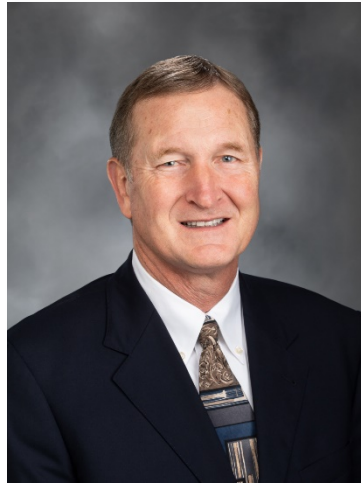
Senator Jeff Holy 6 th District