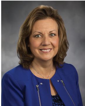
Senator Lynda Wilson