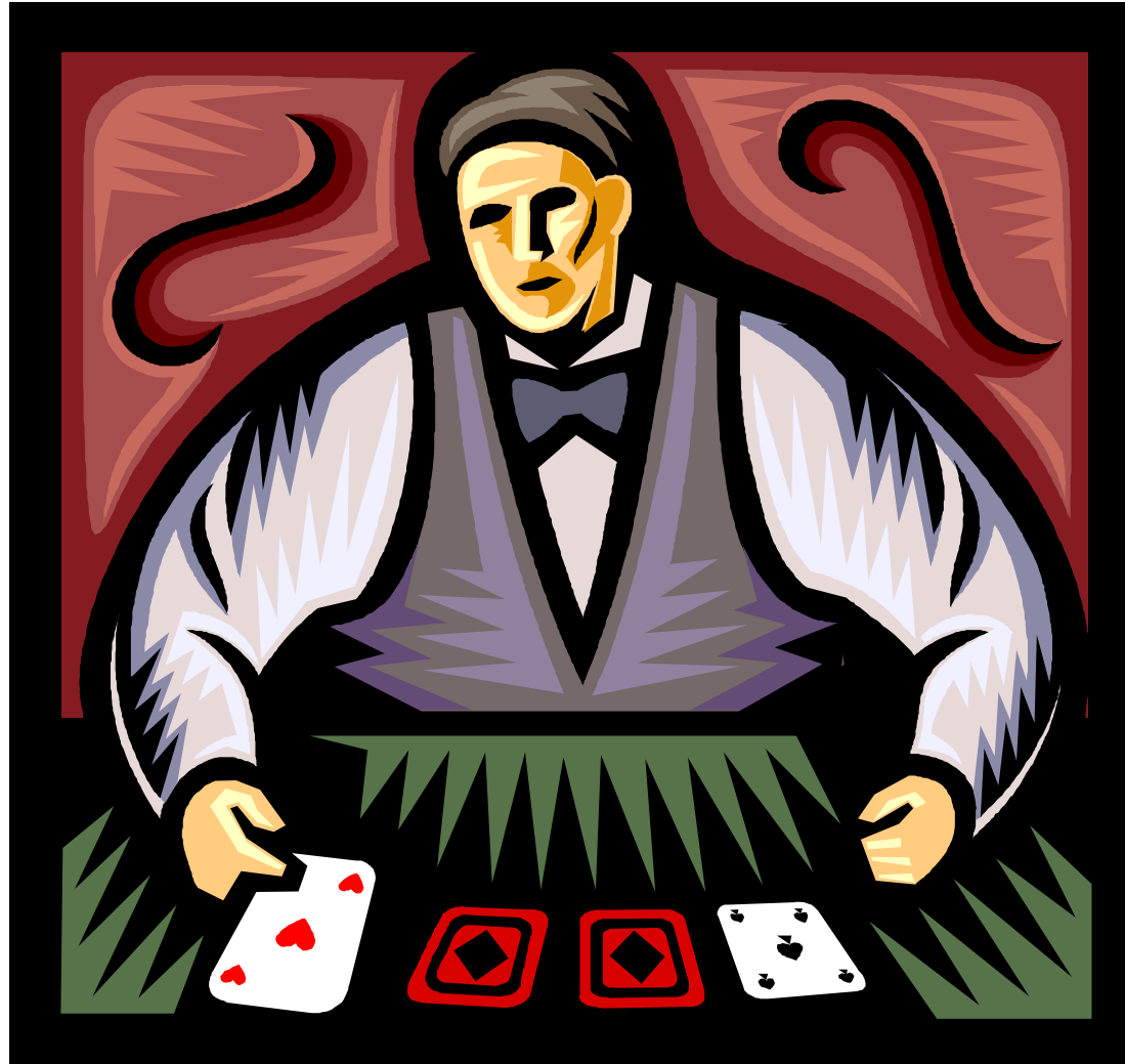
Table Game Examples